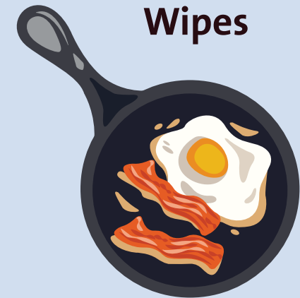
Fats, Oils, Grease